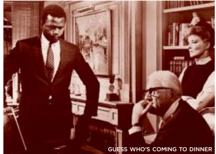
GUESS WHO'S COMING TO DINNER

On June 29, 2003, the world lost its First Lady of Cinema: Katharine Hepburn, or simply, Kate. The greatest actress to grace the screen (she is ranked #1 Woman in the AFI's "50 Greatest Movie Legends"), Katharine Hepburn reigns as the only four-time Oscar recipient for acting. (She is second in nominations only to Meryl Streep, who passed her in 2002 with her 13th nod.) Hepburn's career met with requisite ups and downs (including rebounding from the moniker of "box office poison"), as she continued to break new ground and defy convention with strong portrayals of striking women. Hepburn was once quoted as saying, "Wouldn't it be great if people could get to live suddenly as often as they die suddenly?" Fortunately, Hepburn's act of "living suddenly" is captured often in an impressive body of work. AFI is honored to present a representative selection of work from her magnificent seven-decade career, including—from AFI's June 2002 list of 100 Passions, in which Hepburn led all actresses with six films—PHILADELPHIA STORY (#44), BRINGING UP BABY (#51), AFRICAN QUEEN (#14), ON GOLDEN POND (#22), GUESS WHO'S COMING TO DINNER (#58) and WOMAN OF THE YEAR (#74).