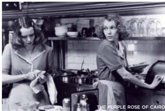
THE PURPLE ROSE OF CAIRO

cop's daughter Trudy Knockenlocker (Betty Hutton) comes back pregnant from a date with a soldier, but it's okay. Complete with a curtain ring on her left hand, she actually married Private... Ratsky-Watsky?! Crusty dad William Demarest enlists her perennially hapless swain Eddie Bracken to the rescue in Preston Sturges' frenetically hilarious small town version of the Immaculate Conception—except this time it's... how many tuplets?