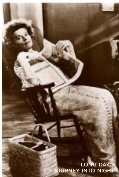
LONG DAY'S JOURNEY INTO NIGHT

Directed by Sidney Lumet. 1962, b&w, 174 min.