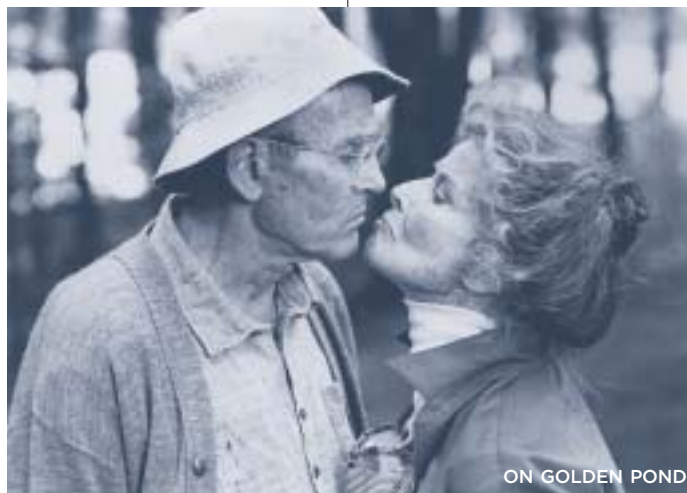
ON GOLDEN POND

Adapted by Ernest Thompson from his own play, ON GOLDEN POND