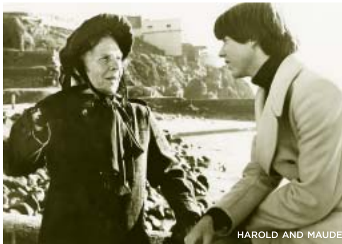
HAROLD AND MAUDE

As AFI honors the passing of Katharine Hepburn with a tribute that includes many of her collaborations with Spencer Tracy, this seems a fitting time to celebrate some other memorable screen pairings, assembled from the complete collection of AFI 100 lists.