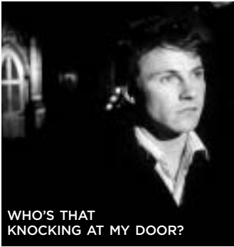
WHO'S THAT KNOCKING AT MY DOOR?