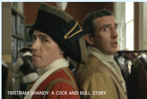
TRISTRAM SHANDY: A COCK AND BULL STORY