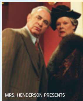
MRS. HENDERSON PRESENTS

WINNER Audience Award, German Film of the Year, 2005 German Film Awards