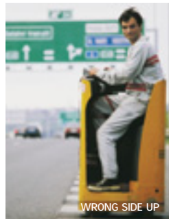
WRONG SIDE UP