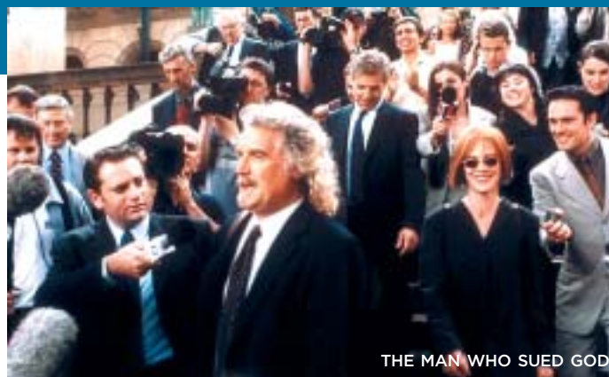
THE MAN WHO SUED GOD