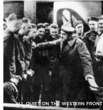
ALL QUIET ON THE WESTERN FRONT

ALL QUIET ON THE WESTERN FRONT follows through the Great War a group of German schoolboys urged to enlist by a jingoistic teacher. Told entirely through the experiences of these young German recruits, the film challenges the traditional glorification of war and the tendency to demonize the opposition by highlighting the tragedy of war through the eyes of the enemy. This early sound masterpiece showcases the brutality and bewilderment of war,