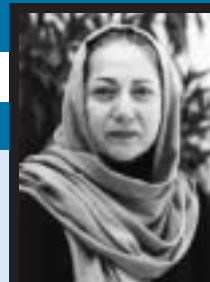
Director Rakhshan Bani-Etemad in person!