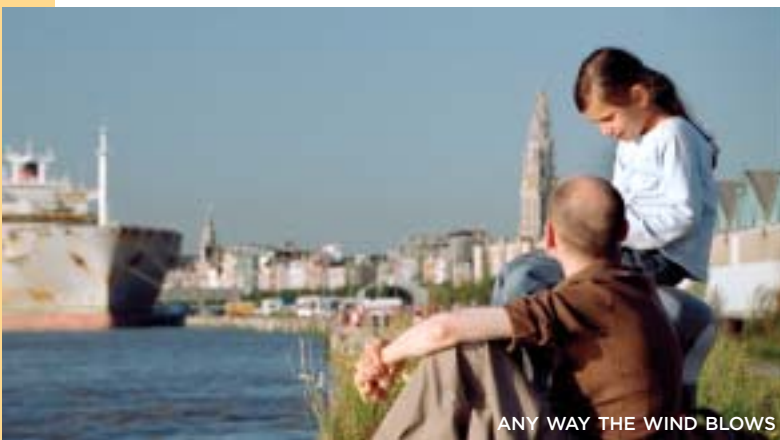
ANY WAY THE WIND BLOWS