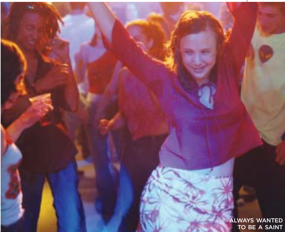
ALWAYS WANTED TO BE A SAINT