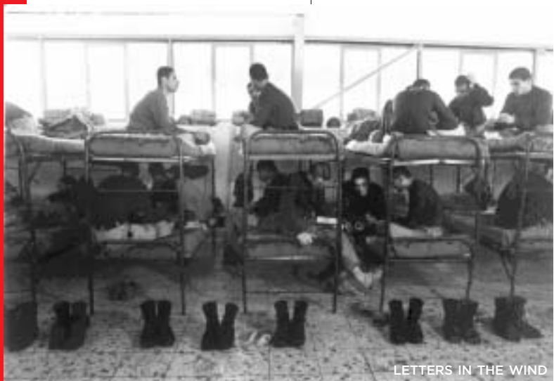
LETTERS IN THE WIND