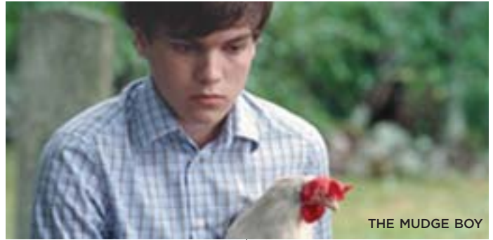
THE MUDGE BOY